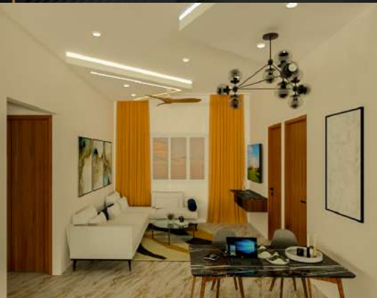
Living room (F-2 ,S-2 ,T-2)