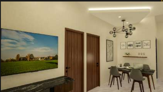
Dinning room (F-2 ,S-2 ,T-2)

There's a palette of fine features and finishes proving that a true perfectionist was behind planning every amenity you see around you