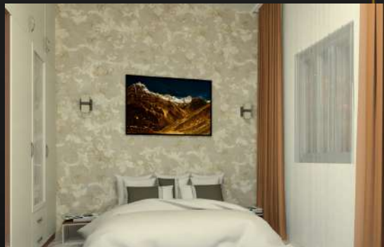
Guest bed room (F-1,S-1,T-1)

Freedom to customize with respect to your needs