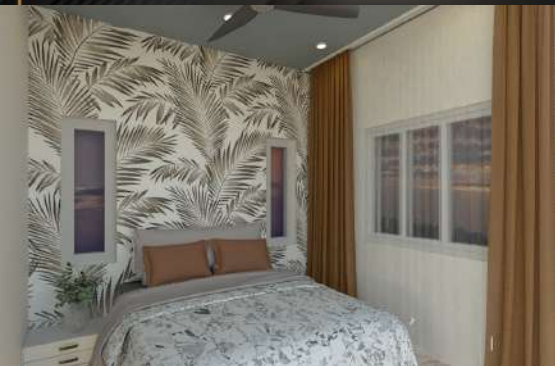
Kids bed room (F-1,S-1,T-1)