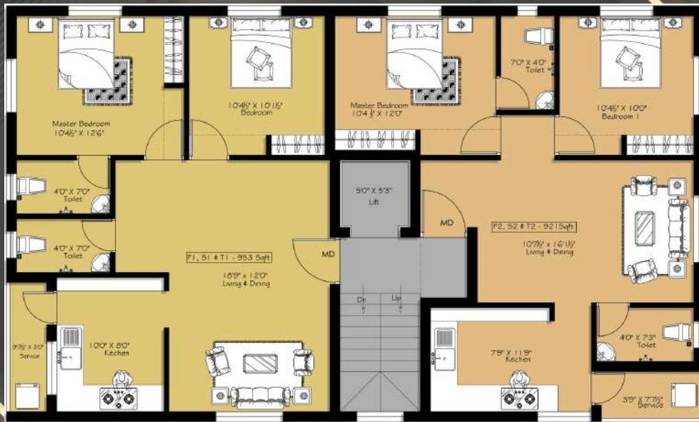
Area statement F1,S1,T1 - 953 sqft F2,S2,T2 - 921 sqft