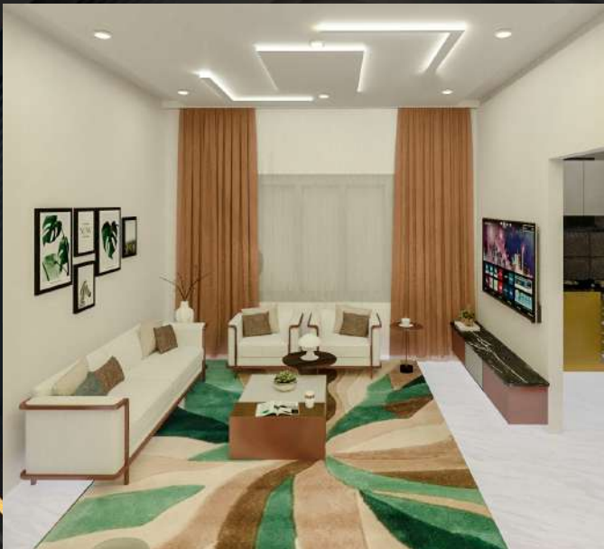
Living room (F-2 ,S-2 ,T-2)